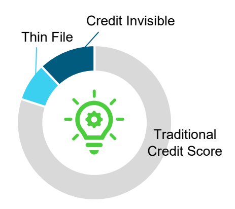
US Population vs. Credit Invisible / Thin File Consumers

Let us show you the value of our data – contact us today to engage in a complementary data study